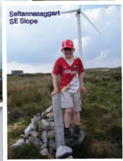
Seltannasaggart SE Slope