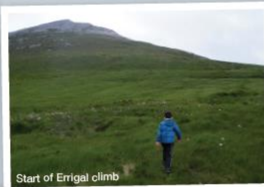
Start of Errigal climb