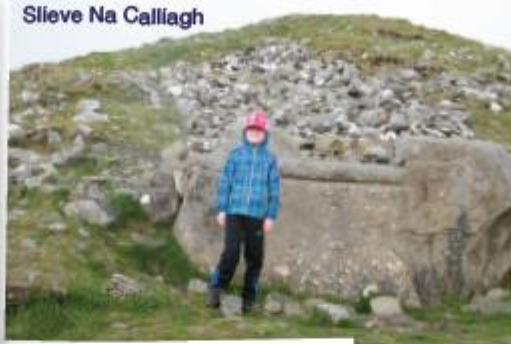
Slieve Na Calliagh