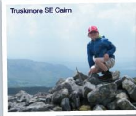
Truskmore SE Cairn