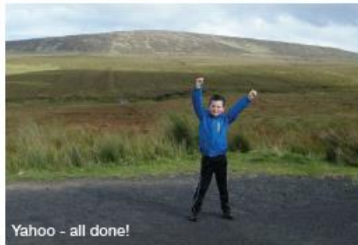
Yahoo - all done!