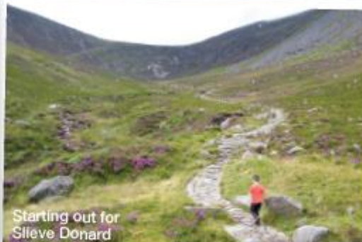
Starting out for Slieve Donard