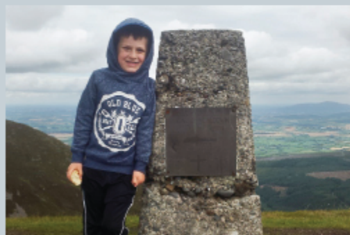
Chilly on Knockmealdown

We maintain a Facebook page for the challenge, again with pictures and details of all the walks, the facebook page is: https://www.facebook.com/32-County-High-Point-Challenge-953465461439788/