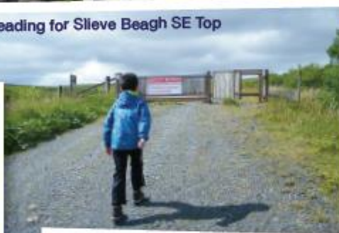
Heading for Slieve Beagh SE Top