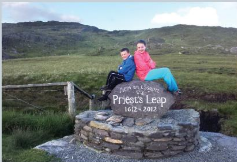
The start of it all: At Priest's Leap before the first County Highpoint, Knockboy